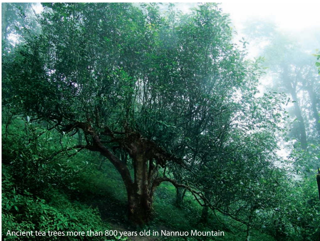
Ancient tea trees more than 800 years old in Nannuo Mountain

You have to visit the virgin forests in southwest Yunnan to see the original ancient tea trees. Oblivious to the changing market economy, these trees remain unmoved, watching the mountain fog gathering and clearing all year round. Unlike young trees which flourish every season padding the tea farmers' wallets, ancient trees slow down their growth, showing dignity. The phrase "tea from wild ancient trees" touches your heart, transporting you to the vast fields and remote mountains, offering tranquility.