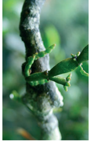
Young 20–30-year-old tea trees at the foot of ancient 400–500-year-old tea trees