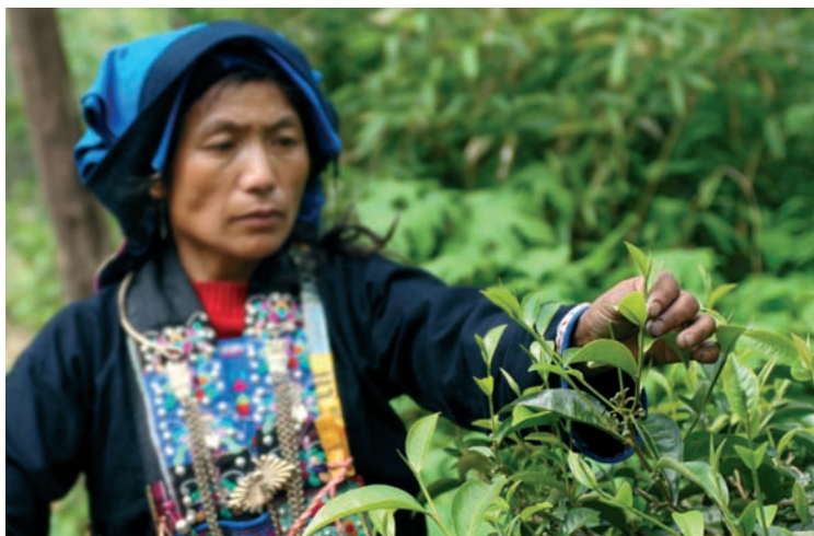
A Hani tea farmer of Bangzha Community in Pu-erh

Where can you find ancient tea gardens but in the mountains? Unlike the tender and light green tea trees found south of the Yangtze River, tea trees here are as sturdy and high as ancient pines, with tough dark green leaves. The rough leaves reflect strength accumulated with age. The tea blossoms are as delicate as they were when the tree first budded. Amid such breathtaking surroundings, one cannot but bow in reverence.