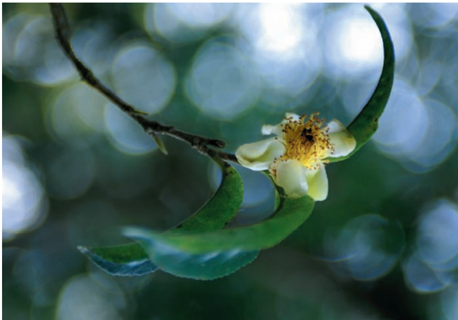
Blossoms of the ancient tea trees in Gaoshan Village of Yiwu