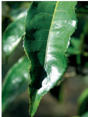
Leaves of ancient tea trees in Yibang