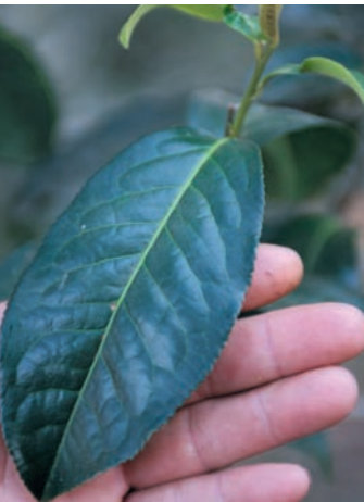
Leaves of ancient tea trees in Yiwu