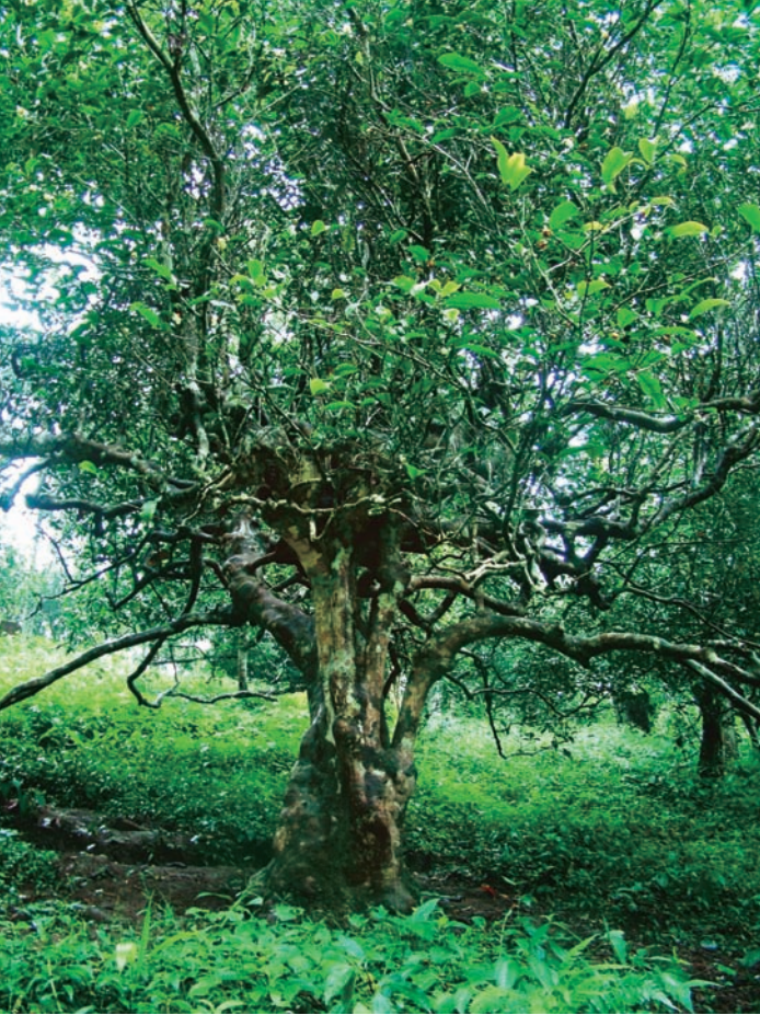
King of tea trees in Nannuo Mountain